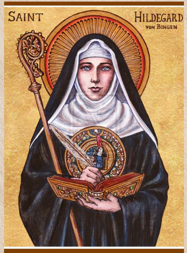
Santa Hildegarda de Bingen (arriba)

Mientras reflexionamos sobre el cuidado de la creación de Dios, nuestra fe nos llama a reconocer el mundo como un don que Dios nos ha confiado. Estamos invitados a ser administradores fieles que protejan el medio ambiente, respeten la dignidad humana y consideren las necesidades de las futuras generaciones. De esta manera respondemos al llamado del Papa Francisco a una “ecología integral”, recordando que el cuidado de la creación y el cuidado de los pobres están profundamente conectados.