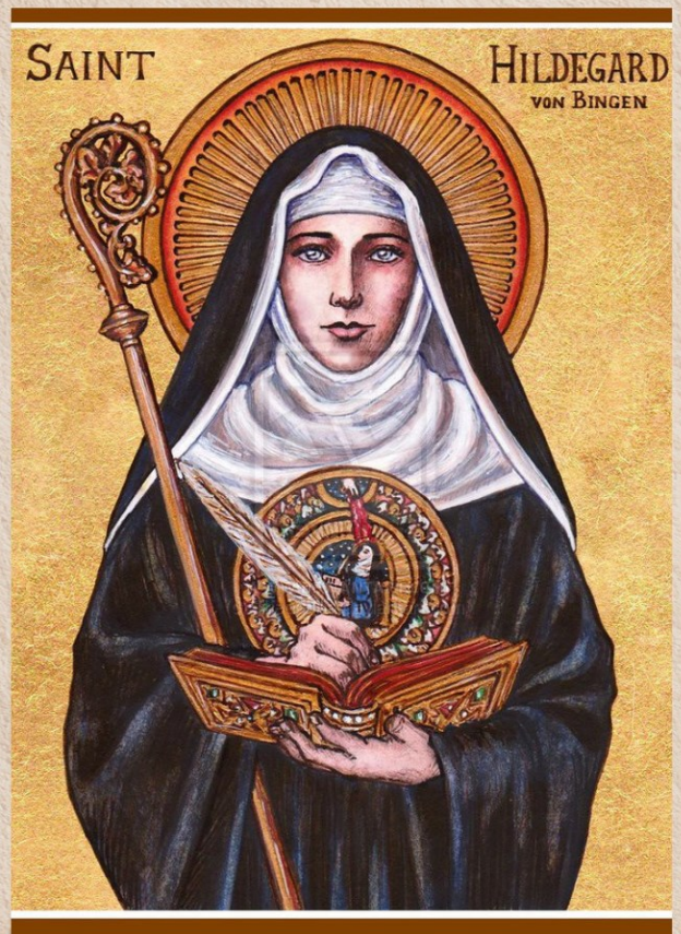
St. Hildegard of Bingen (above)

St. Hildegard of Bingen was 15 when she began wearing the Benedictine habit and pursuing a religious life. She had the gift of prophecy and recorded her visions in writing. Her writings included lives of saints, three volumes of visionary theology and two treatises on medicine and natural history that reflected a quality of scientific observation rare for her time. A Doctor of the Church, St. Hildegard explained that she saw all things in the light of God through the five senses: sight, hearing, taste, smell and touch. Quotes attributed to her include "All of creation is a symphony of the Holy Spirit which is joy and jubilation," "All living creatures are sparks from the radiation of God's brilliance, and these sparks emerge from God like the rays of the sun," and "God desires that all the world be pure in His sight. The Earth should not be injured. The Earth should not be destroyed."