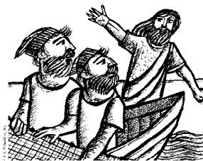
Ellos dejaron las redes y lo siguieron