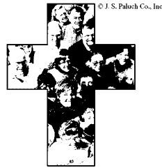
Formación para Adultos

Los padres de familia que tienen a sus niños y niñas en las clases de Educación Religiosa están invitado/as a las clases de formación que se llevan a cabo los mismos días en que los niños asisten a clases. Nos reunimos los sábados de 9:00 a.m. 10:30 a.m. en el Cuarto A.